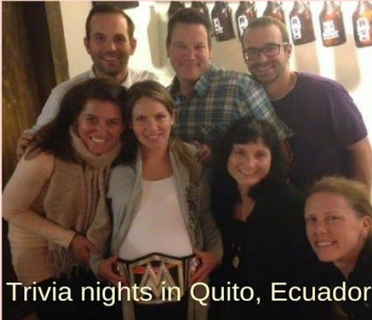
Trivia nights in Quito, Ecuador