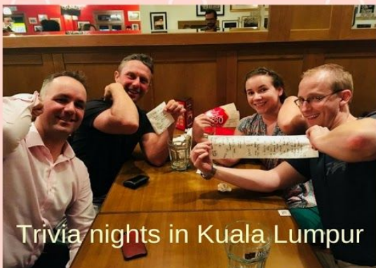
Trivia nights in Kuala Lumpur