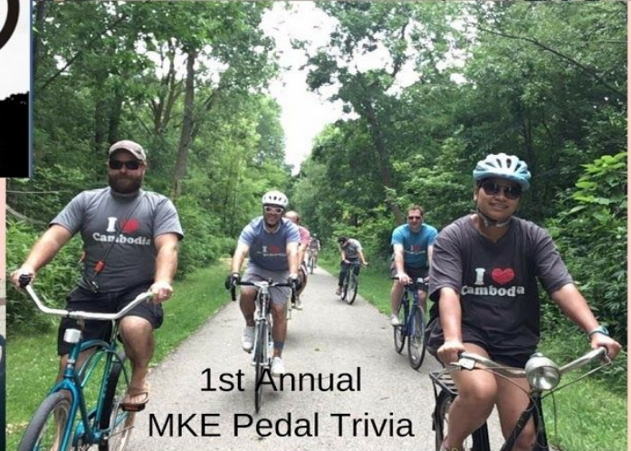
1st Annual MKE Pedal Trivia