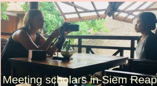
Meeting scholars in Siem Reap