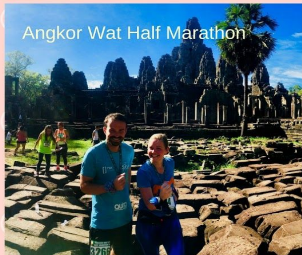
Angkor Wat Half Marathon